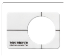
locating plate (included)