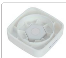
white calibration cavity (included)